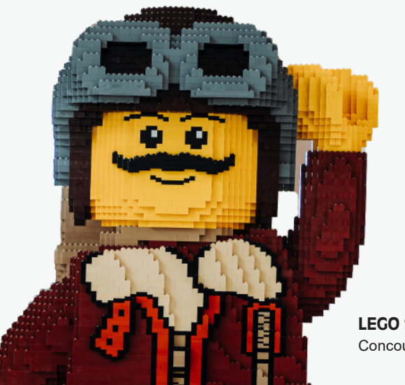
LEGO Store Concourse D